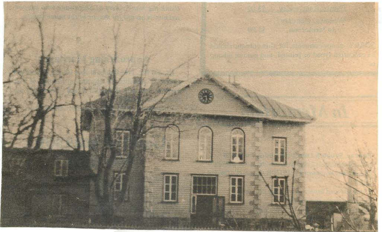
COURT HOUSE - NEW CARLISLE